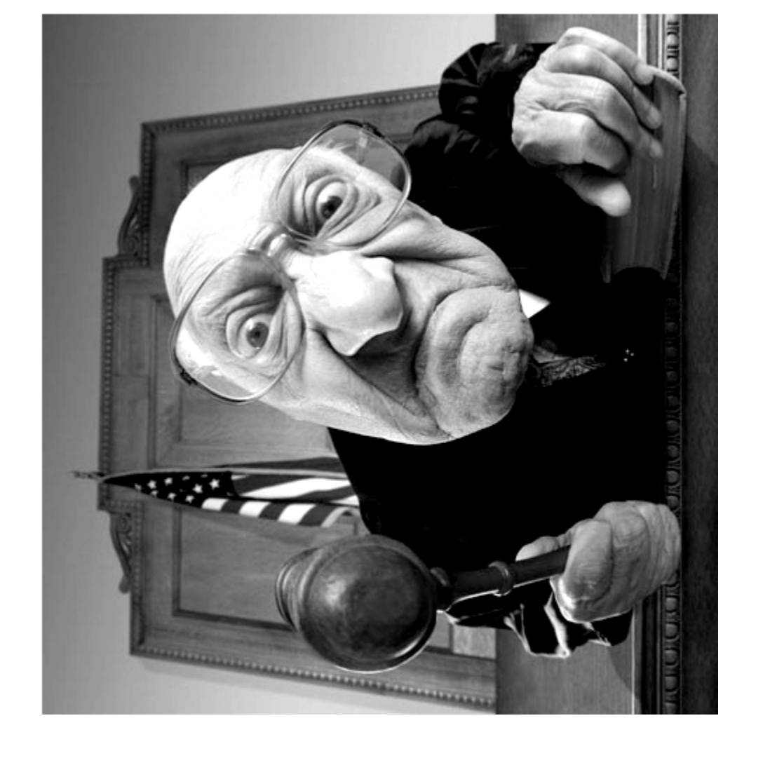
North Coast Earth First!